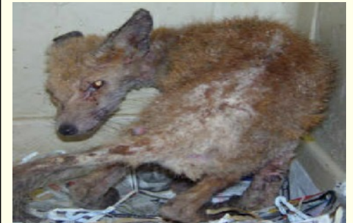
A fox suffering from a very bad case of Sarcoptic Mange