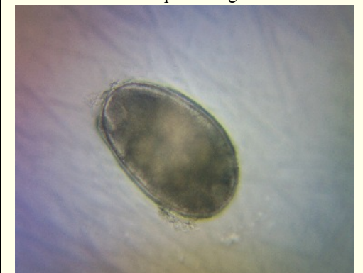
Sarcoptic Mange Mite egg